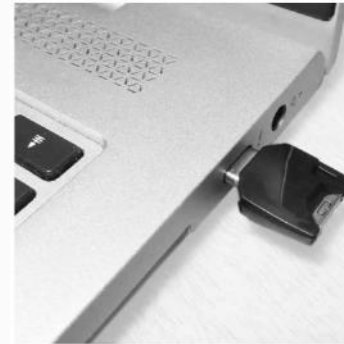
1. Insert your security key in your computers' USB-C port