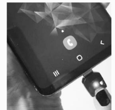
3. Press the button on your security key to authenticate yourself