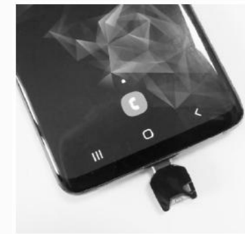
2. Insert the security key into your smartphone's USB-C port