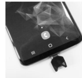
2. Press the button on your security key to authenticate yourself