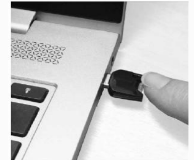
3. Press the button on your security key to authenticate yourself