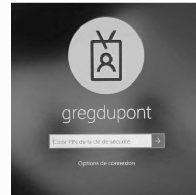
2. Enter the PIN code of your security key