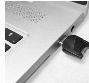
2. Insert the security key into your computer's USB-C port